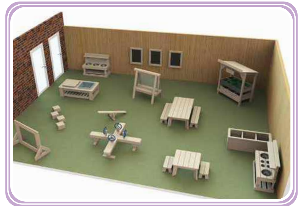
Outdoor Space Planning

We apply our knowledge and experience of early years environments, to ensure we create a space which not only meets aesthetic expectations, but delivers a functional and flexible solution that will work for you.