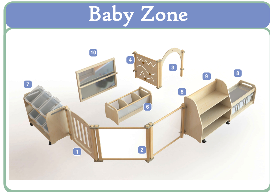
3D CAD Drawing