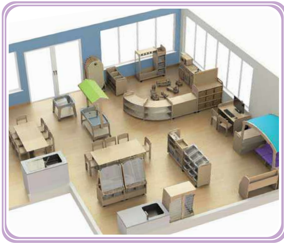
Indoor Room Planning

So, let us take the hassle out of the project for you, and give us a call on 0800 612 5432 or email sales@boardsdirect.co.uk to discuss your requirements.